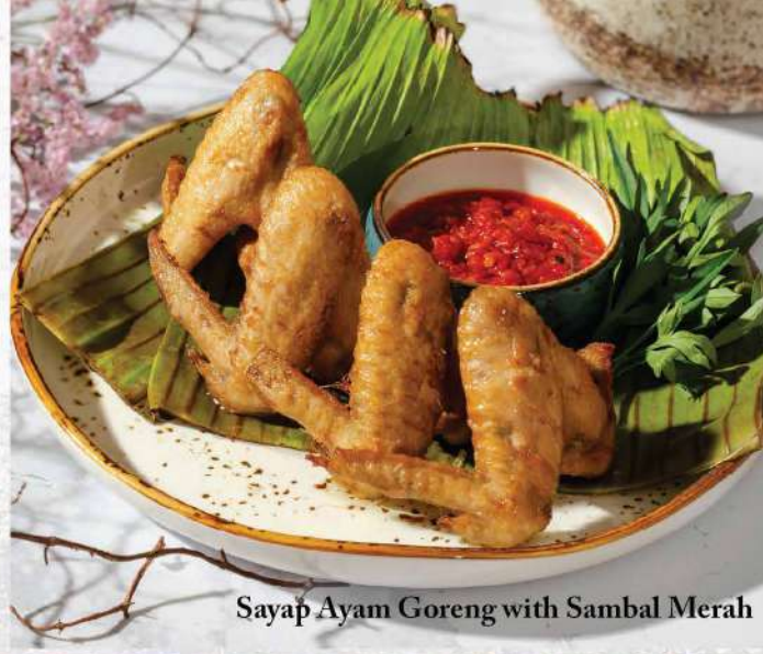
Sayap Ayam Goreng with Sambal Merah