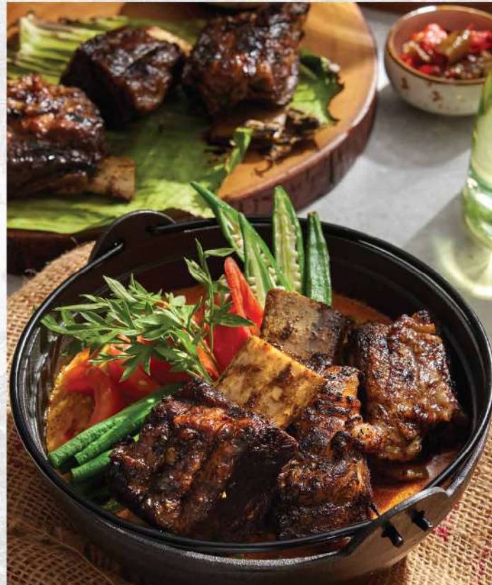
Gulai Lemak Pedas BBQ Beef Ribs