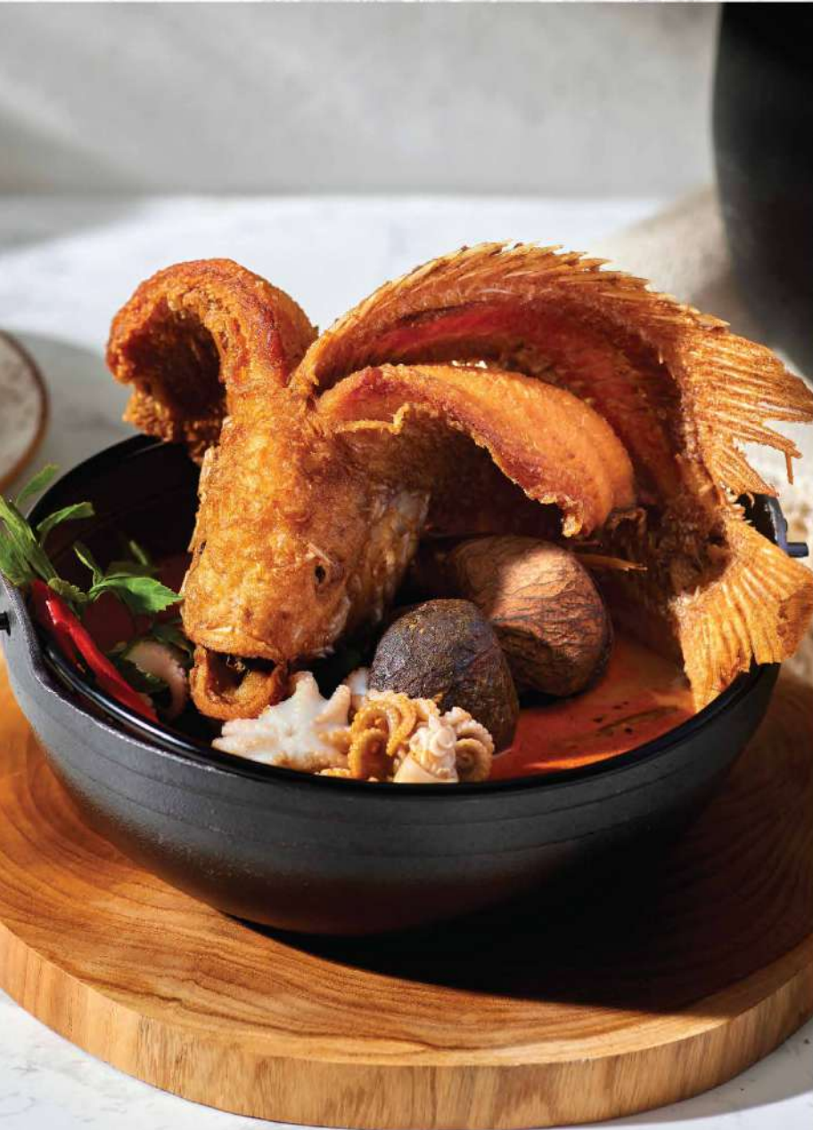
Dancing Fish with Curry Keluak & Baby Octopus