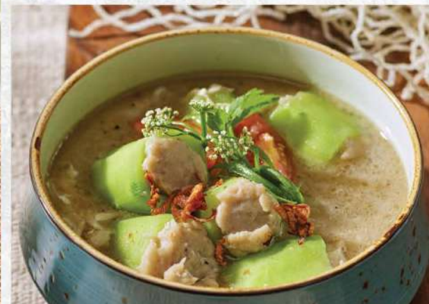
Sup Petola Sumbat Pepes