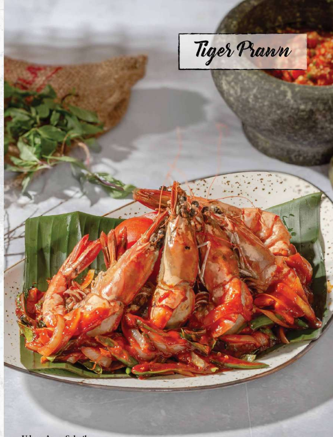
Udang Asam Selasih