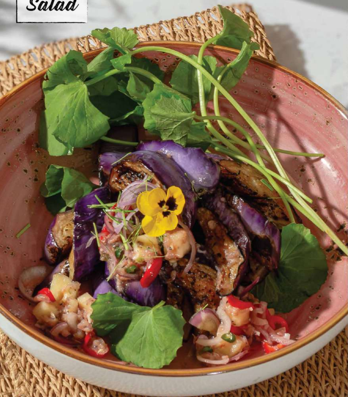
Salad Terung Bakar Cencalok Nanas