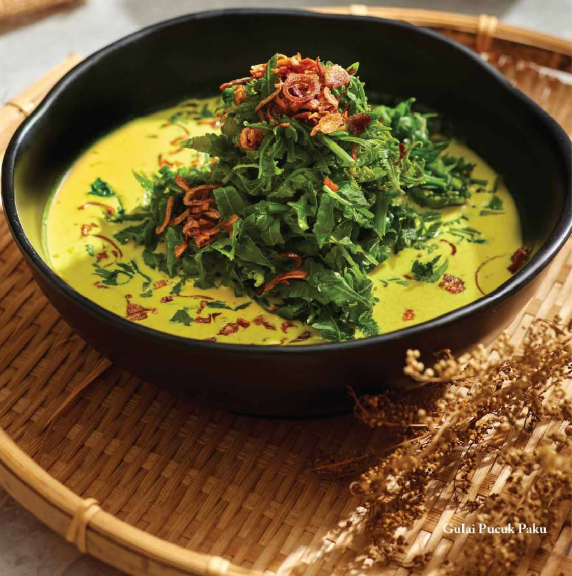
Gulai Pucuk Paku